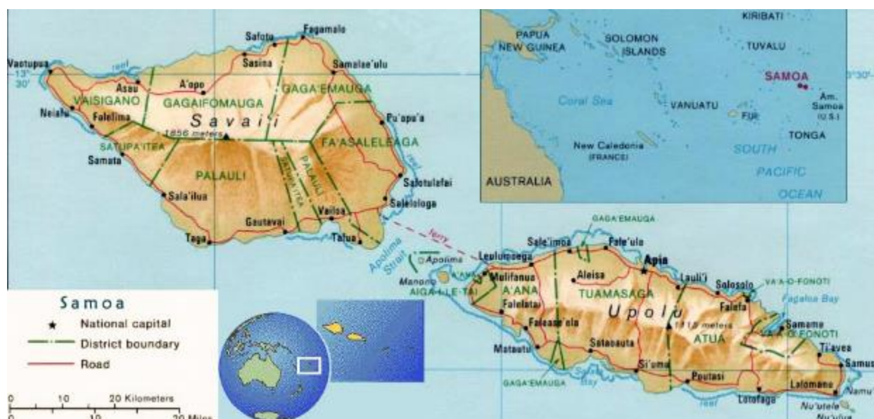
Fig 1 , Location of Samoa in the Pacific. Samoa is made up of two large islands Savai'i and Upolu as well as some smaller islands.

Study area – The nation of Samoa is dominated by two large volcanic islands, Savai'i and Upolu, which lie in the South Pacific. Both islands are over 1,000 km 2 and are mountainous with a maximum elevation of 1,900 m. The climate is marked by seasonality in rainfall with the main wet season falling from December to March.